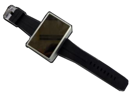
Figure 3. Sensor Bracelet

We designed the sensor node hardware for Sensor Bracelet. It runs TinyOS as the operating system on an ATMega128L MCU. It supports various wireless network protocols including Zigbee and Bluetooth via the CC2420 RF module, Bluetooth module. We used an internal chip antenna so as not to interfere with bodily movement.