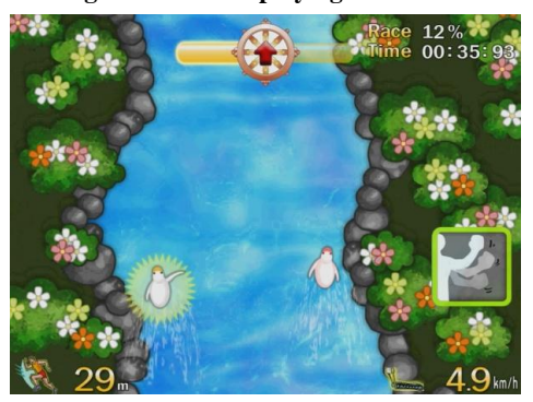
Figure 5. A screenshot of the game display shown to the player in Figure 4

There are a number of game components to increase fun of Swan Boat. Runners may suddenly increase the extent of their interaction to change the direction of their boat to acquire or dodge special game items, like obstacle items that can slow down the boat. If weighed down by such an obstacle, the team members can both flap their arms like wings to get free of it.