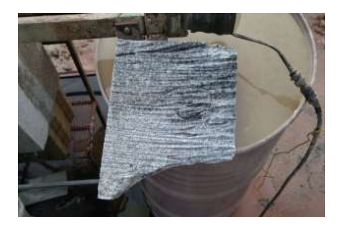
Fig. 7. Cross-section view of a granite specimen (using ASJ system)