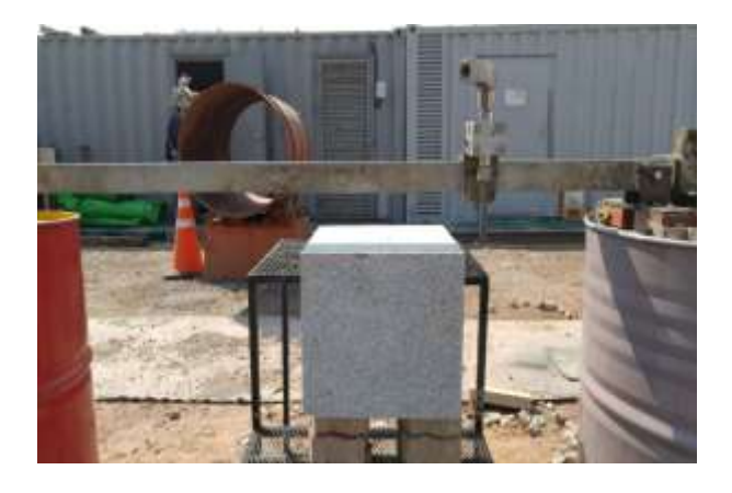
Fig. 1. Components of the AWJ system.

A waterjet using a single nozzle system was implemented by high water pressure with certain water flow rates and traverse speed. For this test we used a diesel plunger pump that generates a high water flow rate. The pump's power was 600 HP and the maximum water flow rate was approximately 80 l/min at 250 MPa. For the orifice and focusing nozzle parts, a sapphire orifice (inner diameters of 0.89 mm) was utilized in this test; the water flow rate reached 18.78 l/min/ea at 250 MPa, and the focusing nozzle inner diameter was 2.29 mm. Waterjet nozzle traverse system can be operated at the same standoff distance conditions (10 mm for a single nozzle system) for a given traverse speed. Water pipes supplied the high pressurized water and abrasive pipes entrained the abrasives inside the nozzle mixing chamber using induced suction pressures (e.g., abrasive injection type).