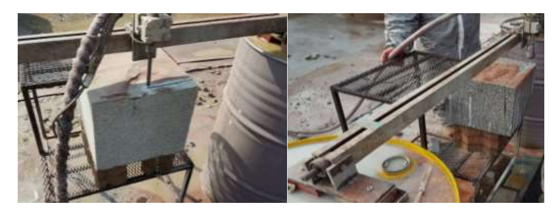
Fig. 3. Overall cutting performance (left: AWJ system, right: ASJ system)

The cutting performance results of the AWJ and ASJ systems are shown in Fig. 3. Fig. 4 demonstrates that the AWJ system has better cutting performance than the ASJ system on traverse cutting, while the cutting ability of the ASJ system has about 60% of the cutting ability of the AWJ system (cutting depth basis). This phenomenon is estimated to occur by the air proportion difference of each abrasive waterjet system. Mostly the AWJ system contains a higher proportion of air than the ASJ system, and the jet stream (high-pressurized water and abrasive) is more distributed by air on comparatively large areas. Therefore, improving the cutting performance in traverse cutting conditions by distributing the jet stream is needed for rock cutting.