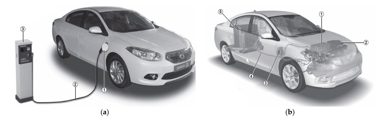
Figure 1. Functional diagram of Electric Vehicle and charging machine: ( a ) 1. Electric Vehicle: SM3 ZE, 2. Standard Charging Cable, 3. Charging Machine: JC 6331; and ( b ) 1. Electric Motor, 2. 12 V supplementary Battery, 3. Charging Inlet, 4. High Voltage Cable, 5. 400 V Traction Battery [47].

A total of 3 fully electric powered vehicles, SM3 ZEs from Renault Samsung Motors, and 3 high-speed charging machines from Joong Ang Control, JC 6331s, were used to conduct the entire experiment during our research. The fully-charged mileage of SM3 Ze is 123 km and the charging time of JC 6331s is 40 min. A detailed functional diagram of the car, the charging machine and the car components are shown in Figure 1.